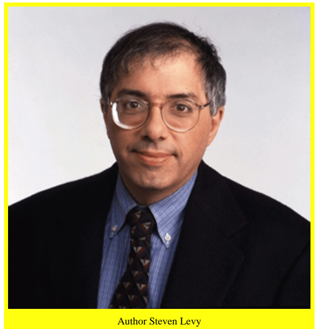
Author Steven Levy

When I began researching Hackers --so many years ago that it's scary--I thought I'd largely be chronicling the foibles of a sociologically weird cohort who escaped normal human interaction by retreating to the sterile confines of computers labs. Instead, I discovered a fascinating, funny cohort who wound up transforming human interaction, spreading a culture that affects our views about everything from politics to entertainment to business. The stories of those amazing people and what they did is the backbone of Hackers: Heroes of the Computer Revolution .